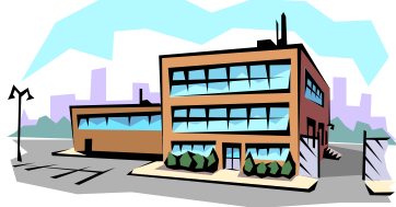
The Monitoring Station