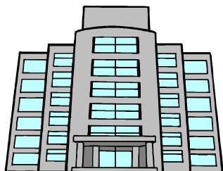
The Protected Premises

For more information call the ULC head office at 1-800-INFO-ULC